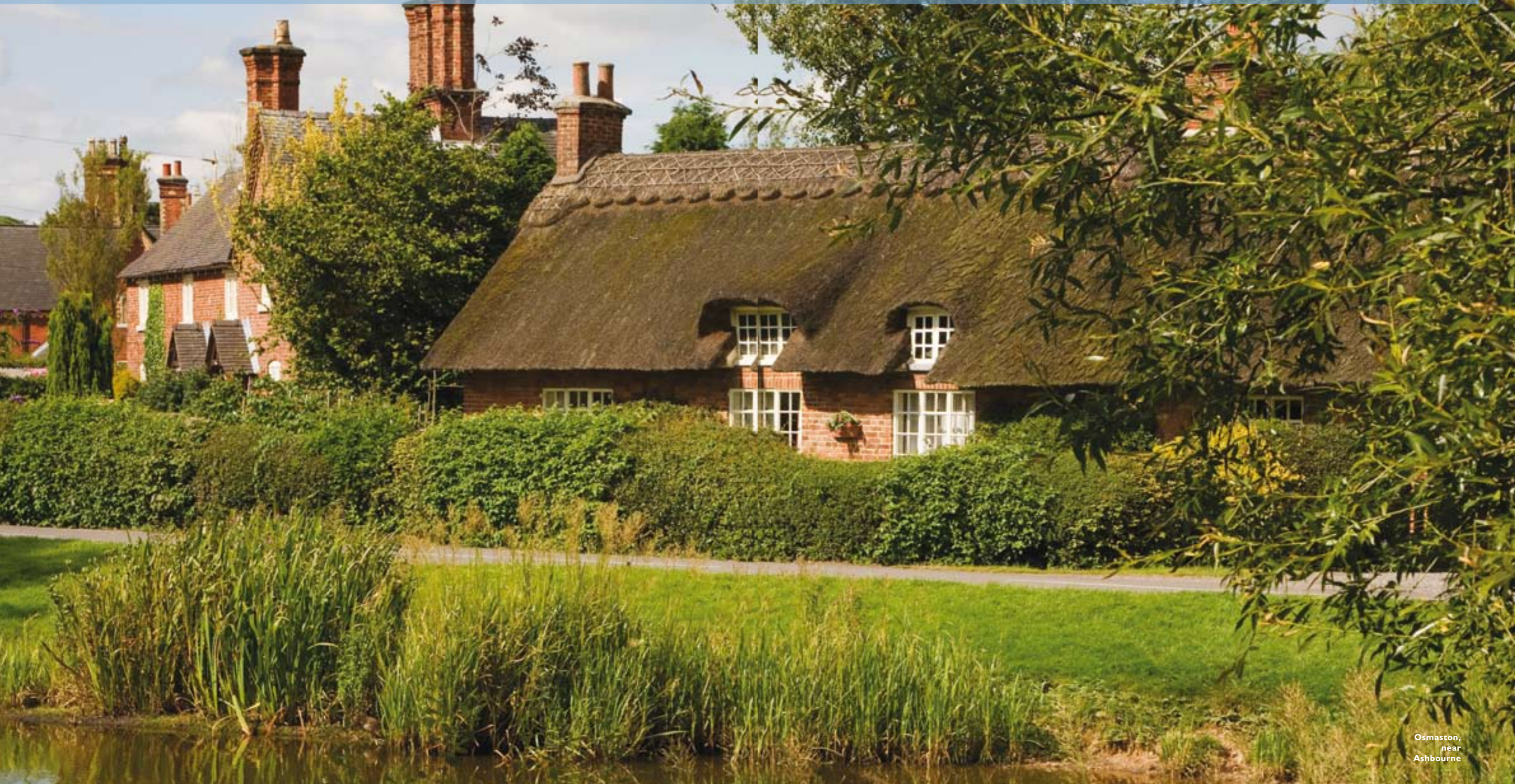
Osmaston, near Ashbourne

Enjoy the quintessential England of your imagination. Explore fascinating towns and villages, splendid gardens and churches, then round off your visit on an awe inspiring underground journey.