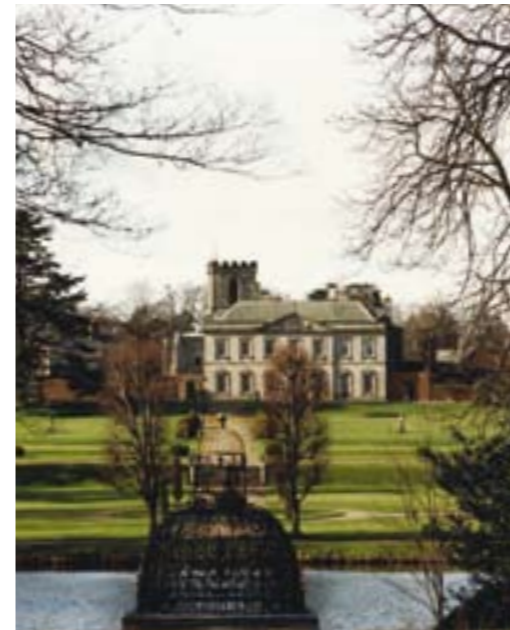
Melbourne Hall Gardens

Well known for its wealth of grand country house gardens, the appeal of the Peak District & Derbyshire's smaller gardens should never be underestimated.