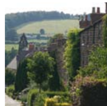
Left: Long Row, Belper Right: Longnor

Other places not to miss are Chesterfield with its intriguing twisted church spire and 800-year old market, and Belper where you can wander up Long Row to admire the carefully tended gardens of former mill worker' cottages, snap up a bargain in a factory shop or enjoy a movie at the recently restored 1930s Ritz Cinema.