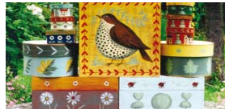
Peak District Products

Look out for modern bargains in some of the factory outlets such as Denby's Factory Shop where you can also see free cookery demonstrations. For great savings on designer outfits, take a trip to East Midland's Designer Outlet, just off junction 28 of the M1.