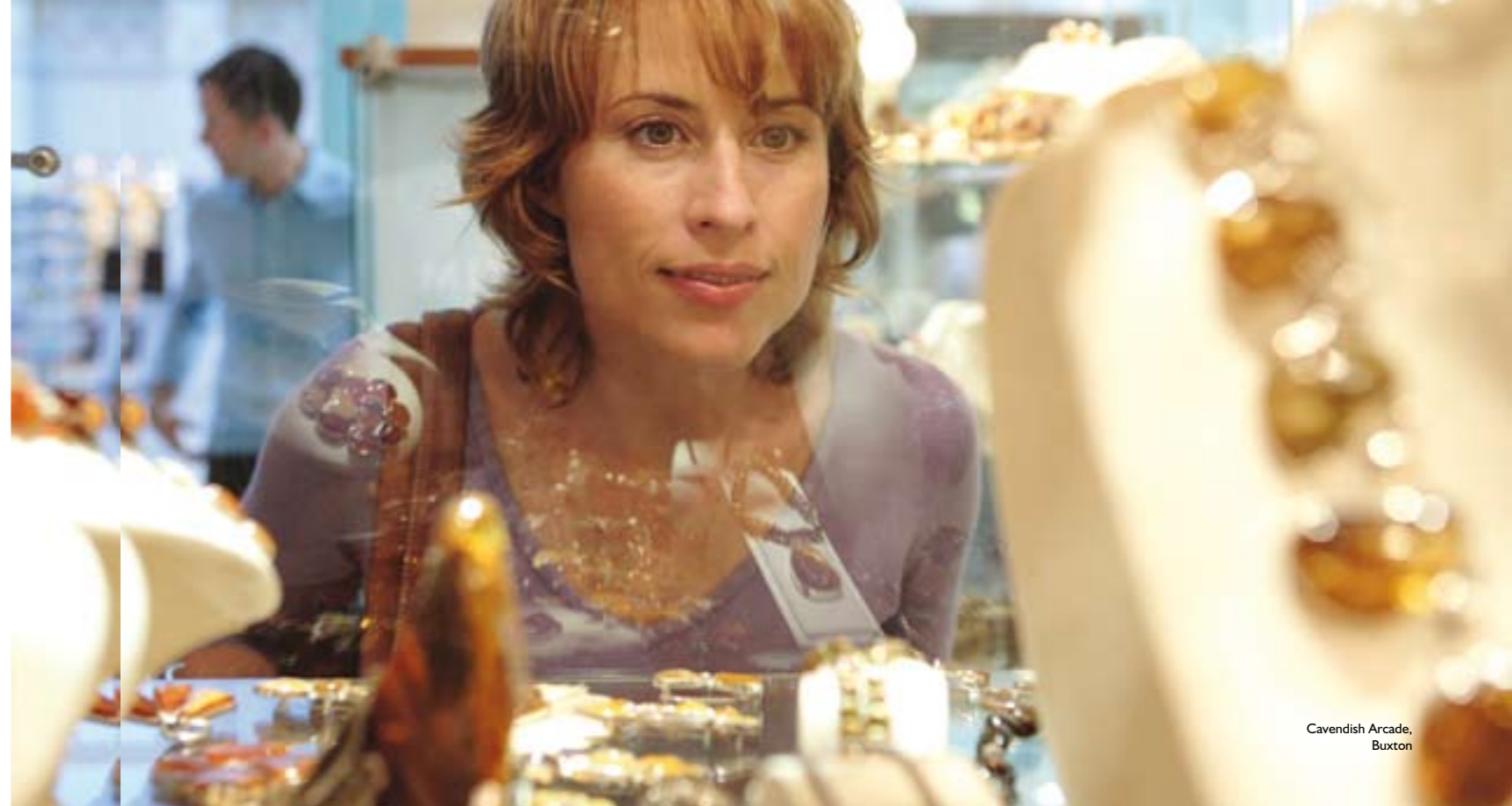
Cavendish Arcade, Buxton