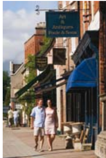
Church Street, Ashbourne

No matter how much you love shopping, in the Peak District & Derbyshire you'll spend as much time looking at your surroundings as the treats inside. Old railway stations, market halls and mills are just some of the venues now imaginatively converted to house modern shopping emporiums. Even the larger shopping villages are in beautiful historic buildings, such as de Bradelei at Belper and Masson Mills near Matlock, a fine example of an Arkwright cotton spinning mill.