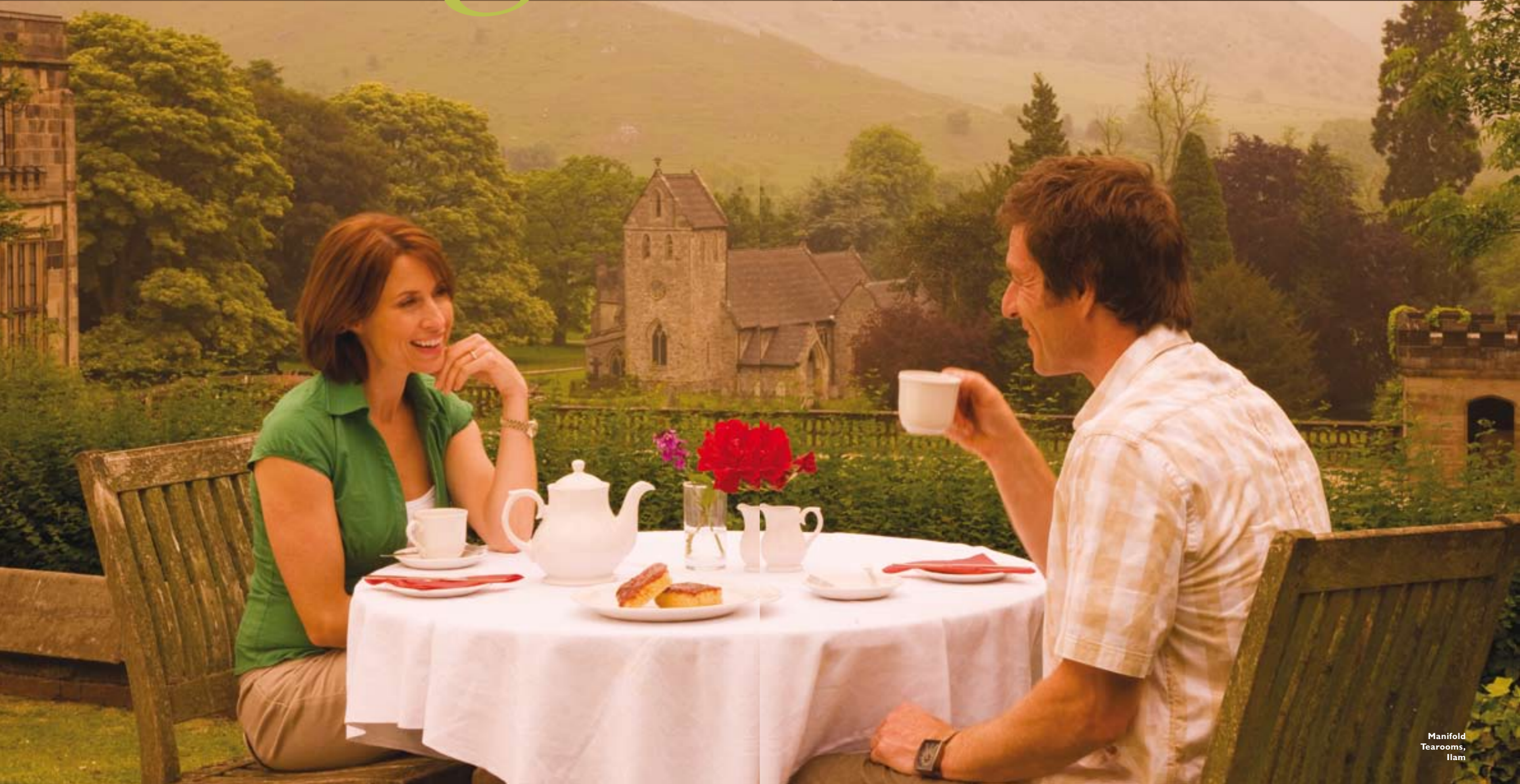
Manifold Tearooms, Ilam

This is your time! Ditch the diet, get ready to relax, enjoy some retail therapy and relish a stay that's all about YOU!