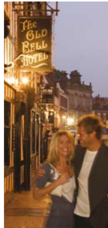
Sadler Gate, Cathedral Quarter

Derby is a bright and cosmopolitan city. Be among the first to visit QUAD – a contemporary art gallery, independent cinema, café, bar and other stimulating spaces in a stunning modern setting.