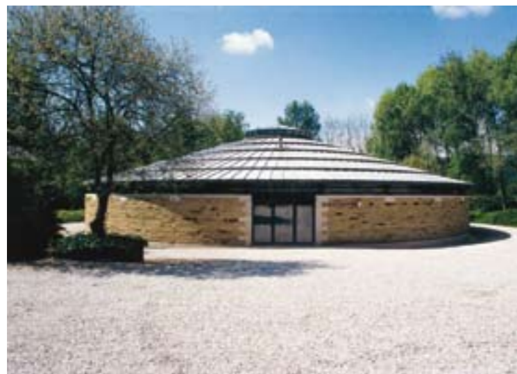
David Mellor Round Building, Hathersage

The Peak District & Derbyshire is perfect for antique hunters, especially those who don't want to pay the high prices of more famous centres. Uncover a treasure at one of the fairs at Kedleston Hall, Derby University or Pavilion Gardens, Buxton. Hunt down an unusual find in one of the many antique shops in Leek, Belper, Ashbourne and Bakewell.