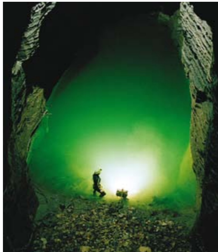
Speedwell Cavern, Castleton

While many churches have soaring spires, it's rare to find one like that above St Mary's & All Saints Church in Chesterfield where you can see an amazing crooked spire. You're equally likely to gaze in awe at the 14th century Tideswell Church, known as the "Cathedral of the Peak".