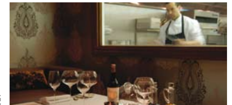
Chef's Table, The Cathedral Quarter Hotel

Enhance your cookery skills with a day at Coghlan's School of Wine, Food & Dining in Chesterfield or bring friends and family to the Chef's Table at the new Cathedral Quarter Hotel in Derby. You'll marvel at the art of a top chef who will talk you through the menu and let you watch all the action in the kitchen through a window in your own private dining room.