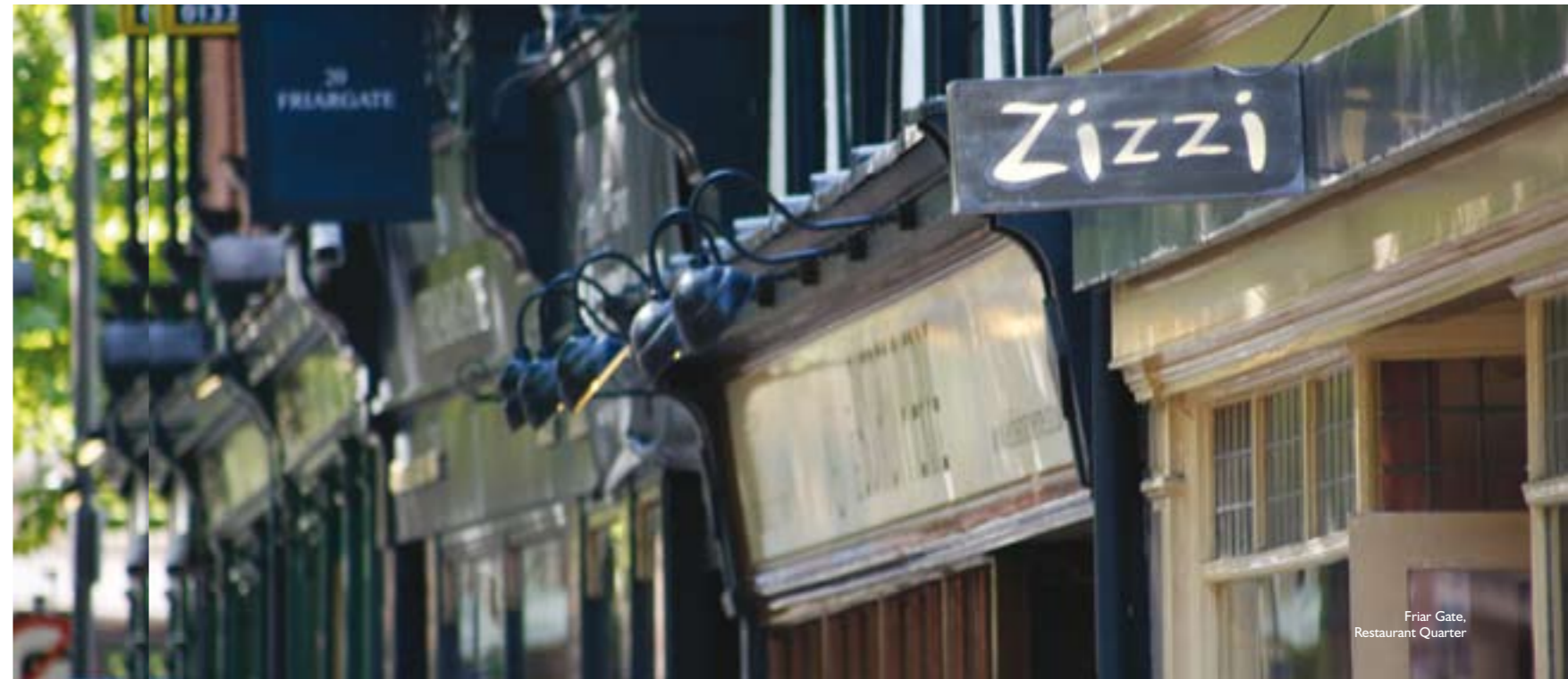
Friar Gate, Restaurant Quarter