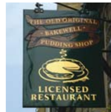
Bakewell Pudding Shop

Initiatives like Peak District Foods www.peakdistrictfoods.co.uk and A Taste of Staffordshire www.tasteofstaffordshire.com will help you to find the very best local food. Meet and talk to the producers at farmers' markets and food fairs. You'll not only love the taste of great fresh food, you'll be supporting local farmers.