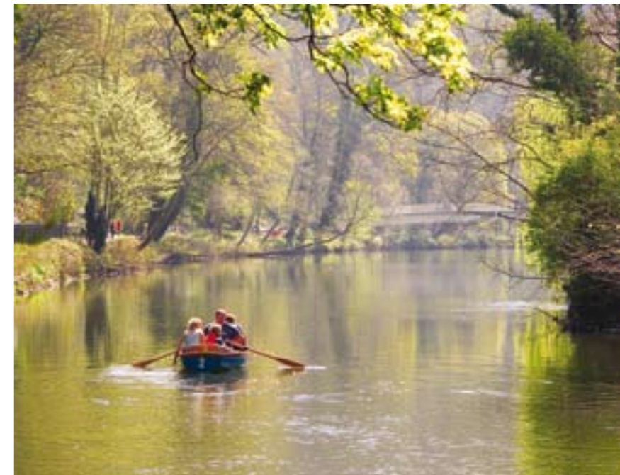
River Derwent, Matlock Bath